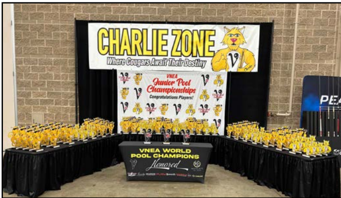
The "Charlie Zone" was the goal for all the players! 132 Charlie's were awarded to our Winners!