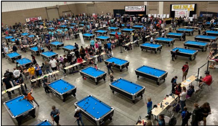
VNEA Juniors Attend In Record Numbers!

Mayo Civic Center - Exhibit Hall Rochester, MN • July 17-20, 2025