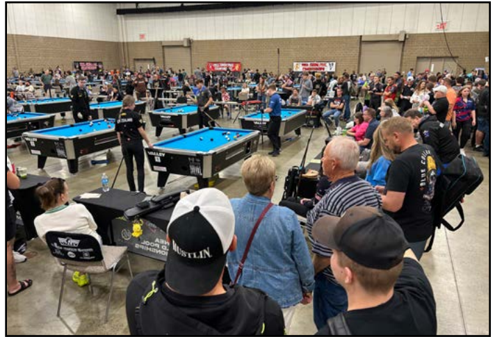
THE OMEGA Finals Arena!