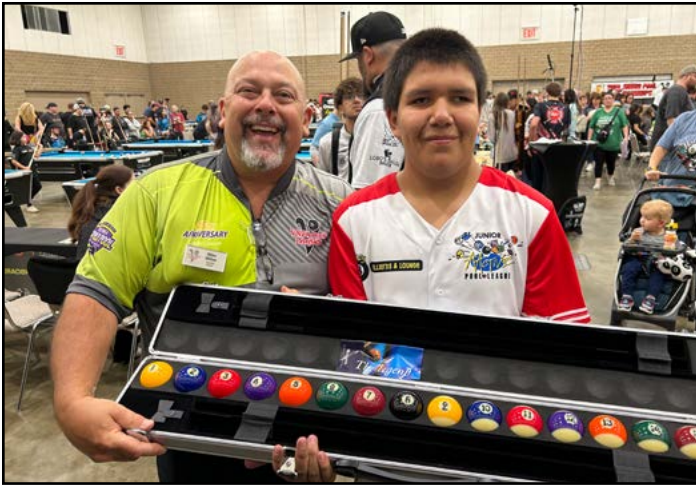
Aramith donated this beautiful Aramith Ball Set & Case