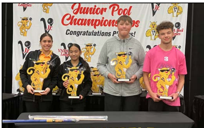
Minor Scotch Doubles Winners