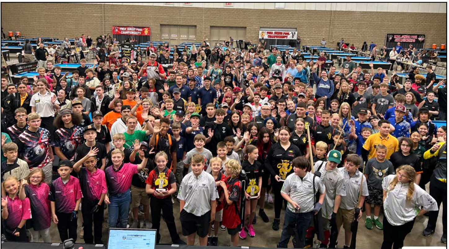
The Team Opening Ceremonies & Singles Presentation was incredible! 800+ in attendance!