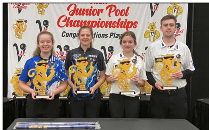
Major Scotch Doubles Winners