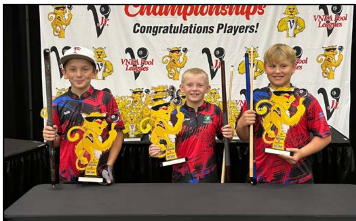
Youth Team Champions