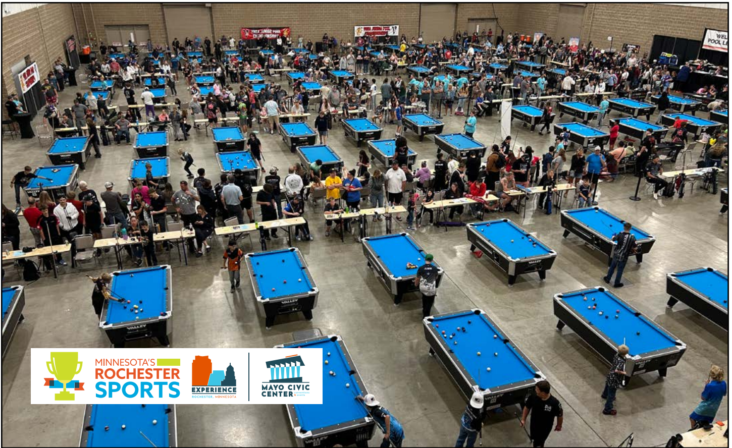
The Mayo Civic Center Exhibit Hall Served As A Great Venue For Our Event! 80 Beautiful Valley Tournament Tables