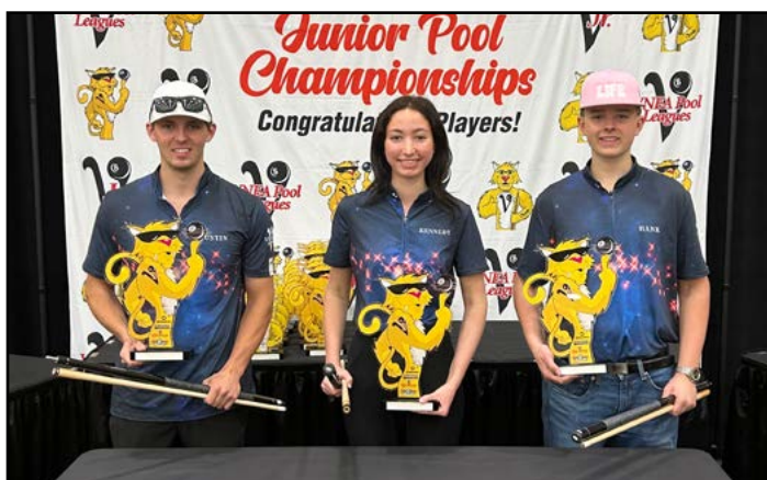
Major Team Champions