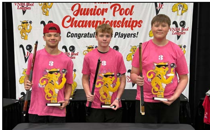
Minor Team Champions