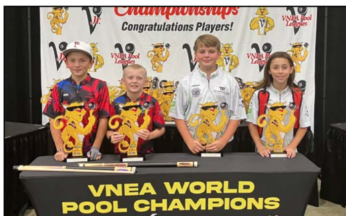
Youth Scotch Doubles Winners