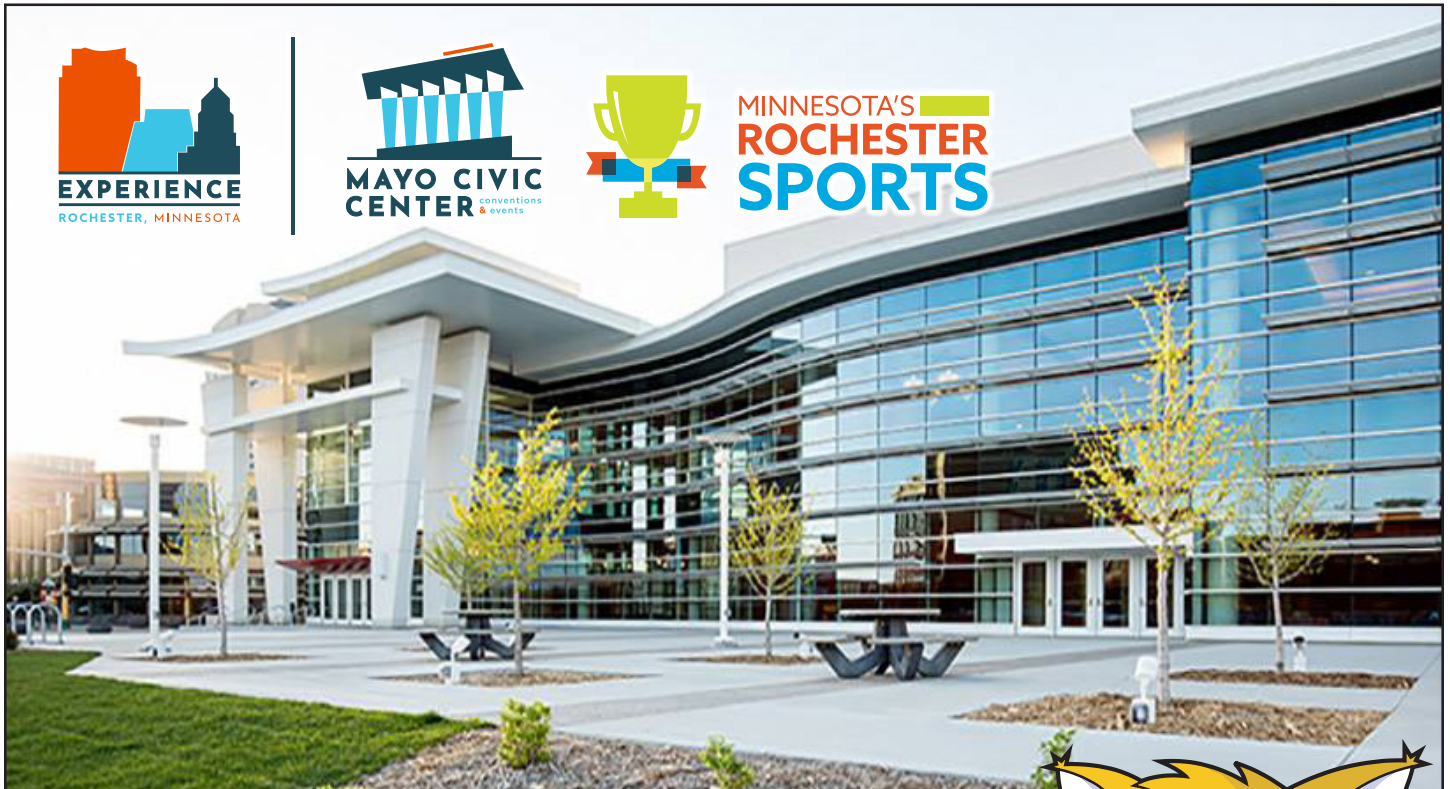
Mayo Civic Center

VNEA is once again bringing the 35th Anniversary International Junior Championships back to where it all began... Rochester, Minnesota. The historic Mayo Civic Center is where all of the exciting Tournament action will take place!