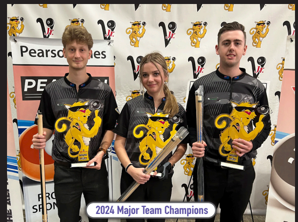
2024 Major Team Champions