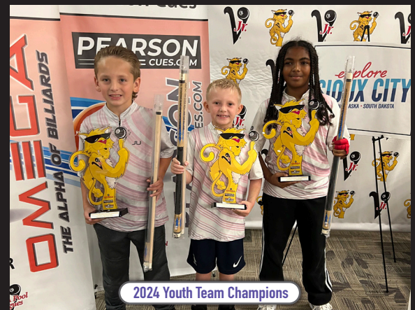
2024 Youth Team Champions