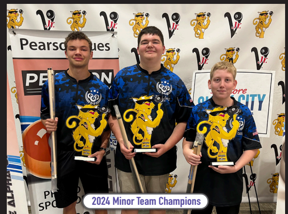
2024 Minor Team Champions