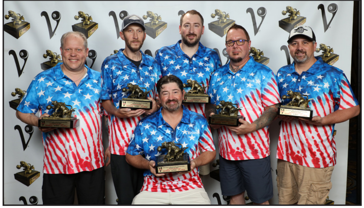
Open Redemption Team Bellator - Warner Coin Machines • PA