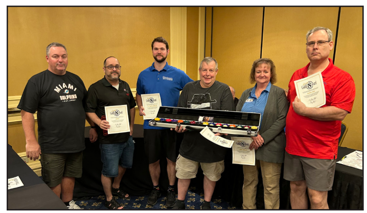
Top Charter Holders recognized for their excellence!