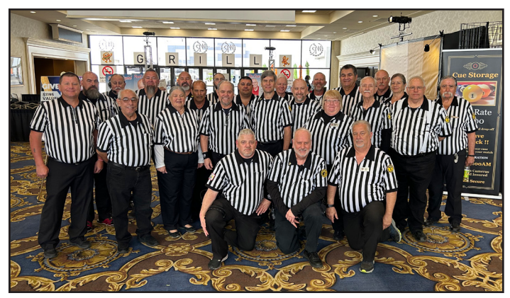
2023 VNEA Referee Staff