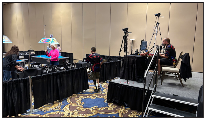
Omega Billiards TV - Professional Streaming Team! Streamed many important matches in the Ozone Finals Arena