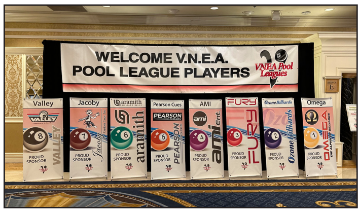
VNEA's Major Sponsors Welcomed The Players!