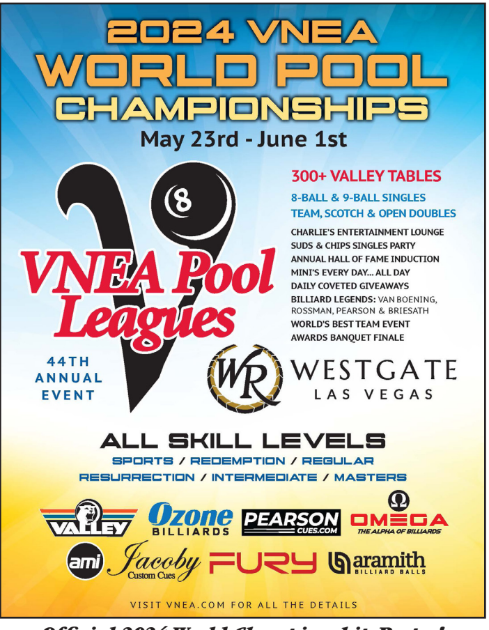
Official 2024 World Championship Poster!