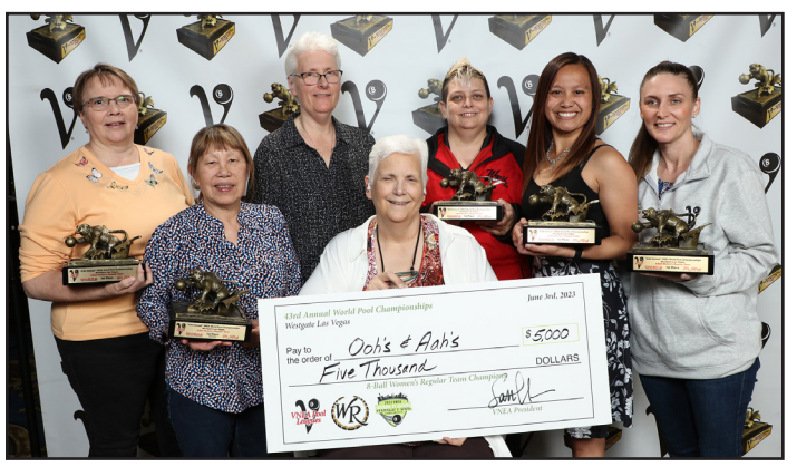
Women's Regular Team Ooh's & Aah's - BMW • NV