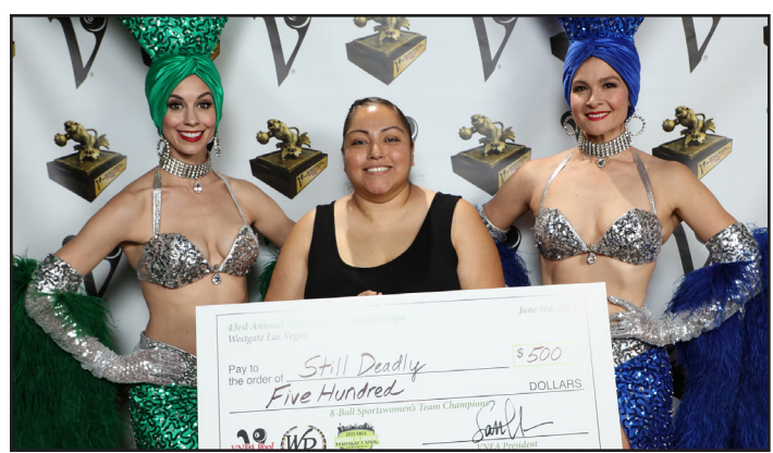
Sportswomen's Team Still Deadly - Wal-Mac Amusements • AB