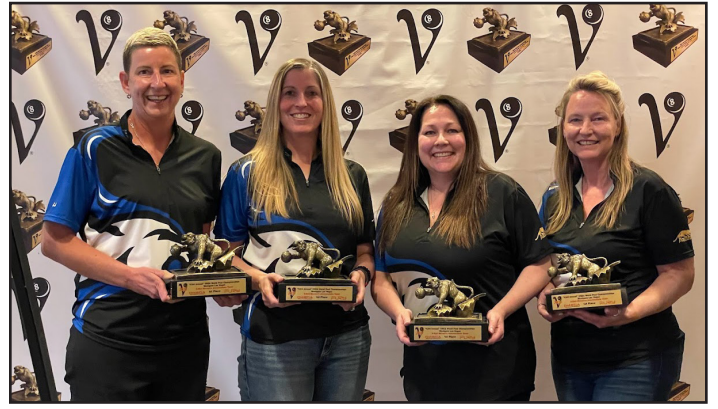
Women's Intermediate Team 2nd Funniest Team In The League - Aactive Coin • MB