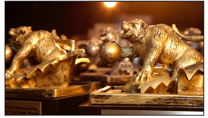
Open Intermediate Resurrection Team Seyberts - Pioneer Vending • OH