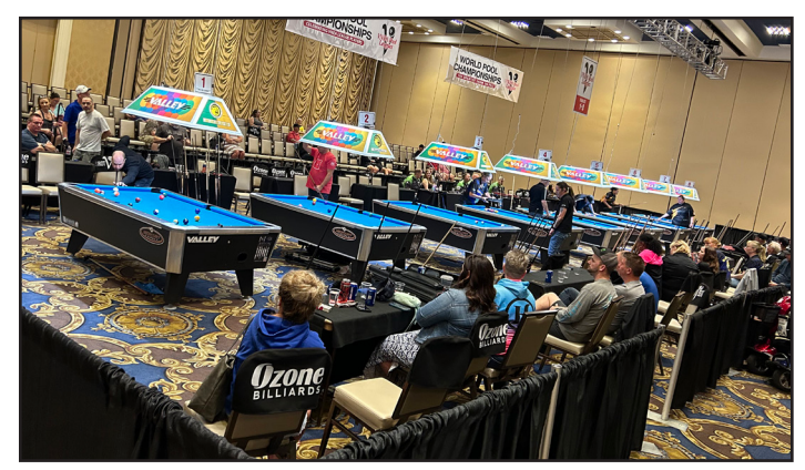
The OZONE Finals Arena