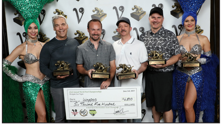
Open Intermediate Team Wappoo - Bell Music • OH