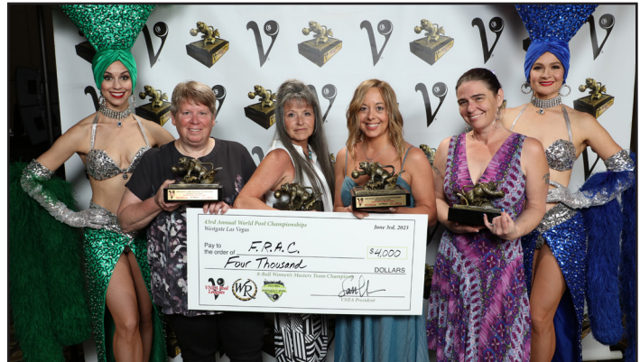
Women's Masters Team F.R.A.C. - Shaffer Entertainment • OH