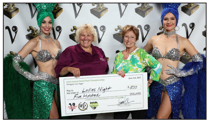
Women's Redemption Team Ladies Night - M & G Services • PA