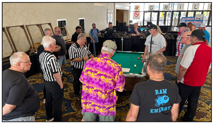
Certified Referee School - Many players took the 2-bour, informative course to become Certified as an Official VNEA Referee