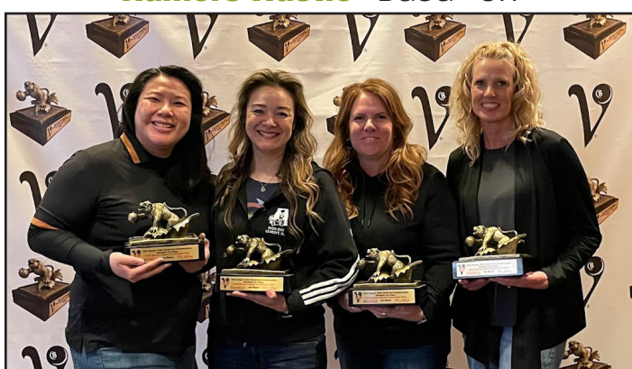
Women's Masters Resurrection Team Maingles - Star Music • IN