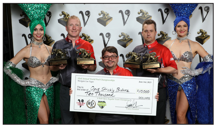
Open Regular Team Opus Strickly Bidnez - Wal-Mac Amusements • AB