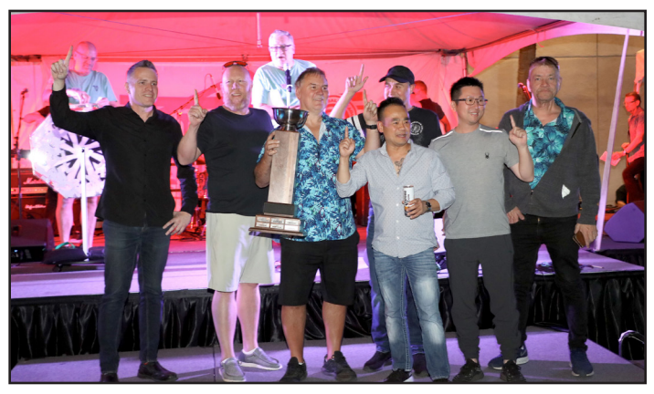
2023 World Team Champions "CANADA"

The VNEA conducted the fun and exciting World Team Championships! Countries put together 4-person teams to represent their flag. USA , Canada , Bahamas , Bermuda , Finland and New Zealand all formed teams for a chance to win the coveted "World Cup"Trophy. When the dust cleared, it came down to Team Canada and Team Bermuda in the finals with TEAM Canada capturing the "World Cup" title! Congratulations to all of the teams that participated in this great event.