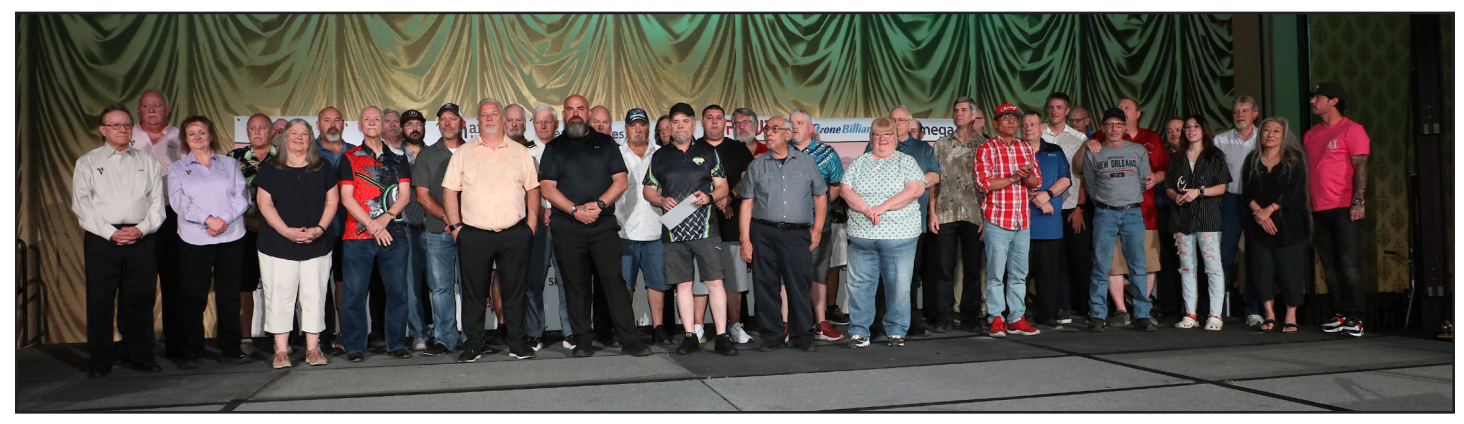
VNEA Tournament Staff: Tournament Committee, Statisticians, Set-Up, Referees