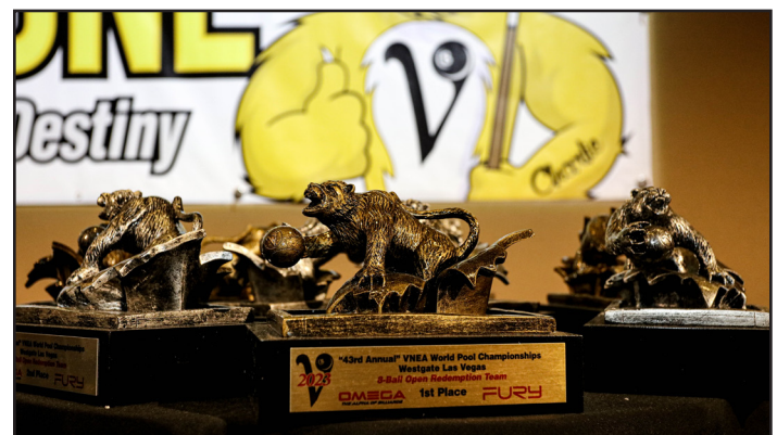
The Coveted Charlie's in the "Charlie Zone"!