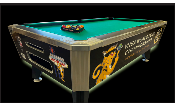
Beautiful Commemorative Valley Home Table