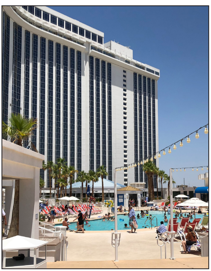
The Westgate served as the perfect setting for our event!