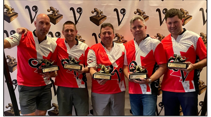
Open Masters Team Balls To The Wall - QVNEA • QC