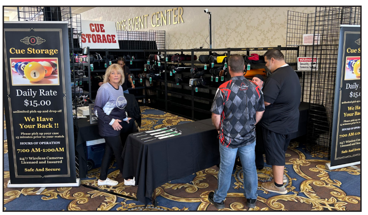
Cue Storage - 24-Hour Cue Protection