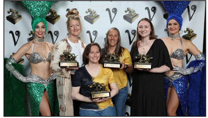
Women's Intermediate Resurrection Team Rumors Hustle - BGSG • OH