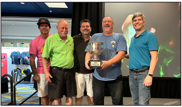
2023 "Valley Cup" Champions - Tournament Staff They narrowly defeated the 2023 Tournament Committee