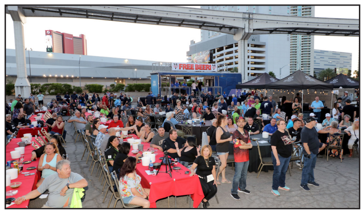
3,000 fired up players in attendance at the Team Opening Ceremonies & Singles Presentation!