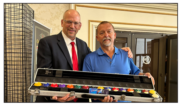
Aramith Ball Sets were raffled off throughout the event!