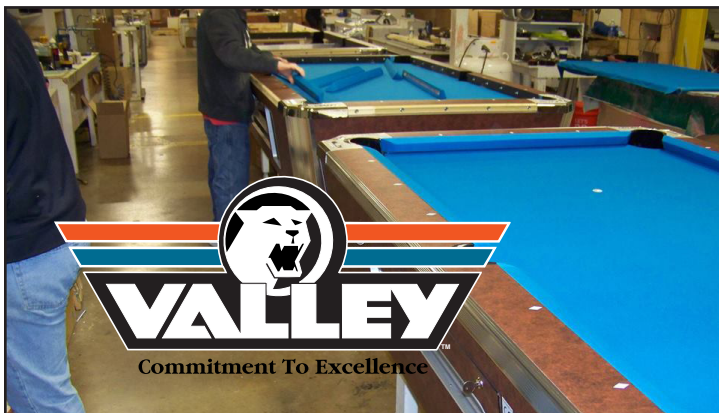
Valley Plant Tour Richland Hills, TX